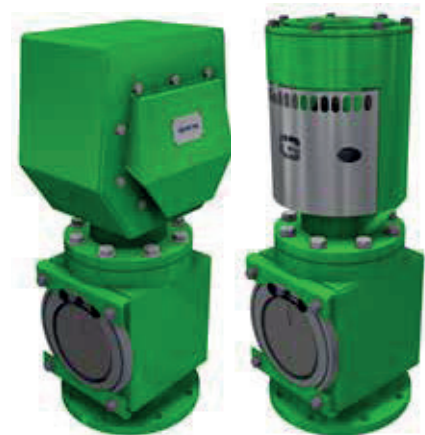
Assembly samples for Aero and Hide on Mud Chamber.