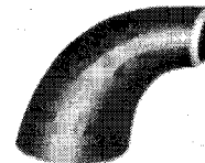
Reducing 90 Ell 112