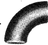
LR 90 611

Additional: Special shapes and sizes, schedules/wall thickness available Bulkhead sleeve pg 105 SweepTees coppernickel only pg 181