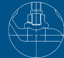
Screw Down Non Return (SDNR)