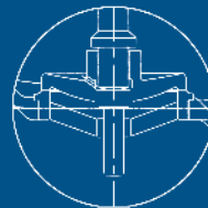
Screw Down Non Return (SDNR)